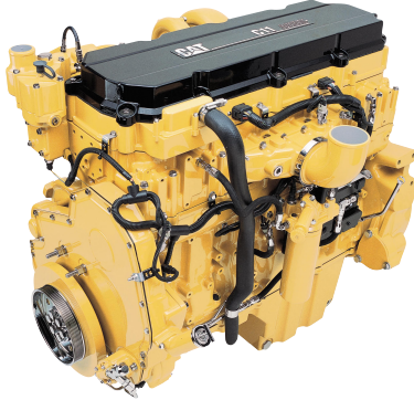
Image shown may not reflect actual engine